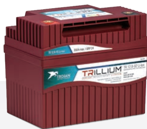
TR 12.8-92 LI-ION

Trillium gives you more runtime and longer life than other batteries in its class and delivers consistent power across the state of charge range. It's 20% smaller than competitors' batteries, can be charged in less than two hours, and is scalable up to 48 volts.