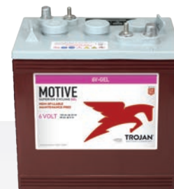
MOTIVE 6-VOLT GEL