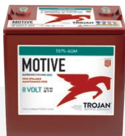
MOTIVE 8-VOLT AGM