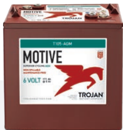
MOTIVE 6-VOLT AGM