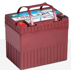
TR 25.6-25 LI-ION

Microprocessor Amp-Hour Life Tracking SOC Gauge Battery Management System Cell Balancing