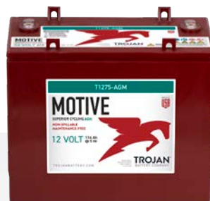
MOTIVE 12-VOLT AGM